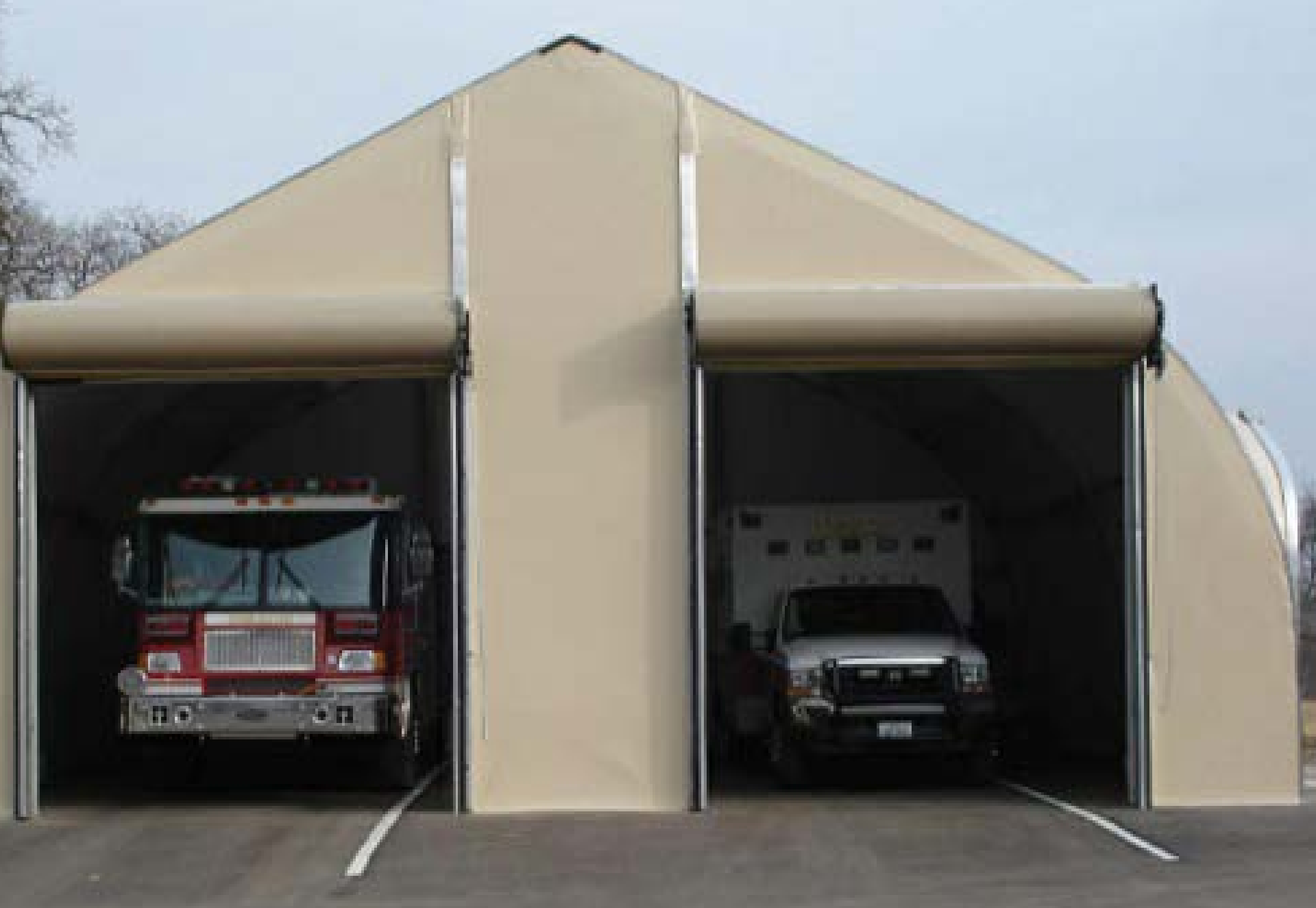
Typical temporary accommodation