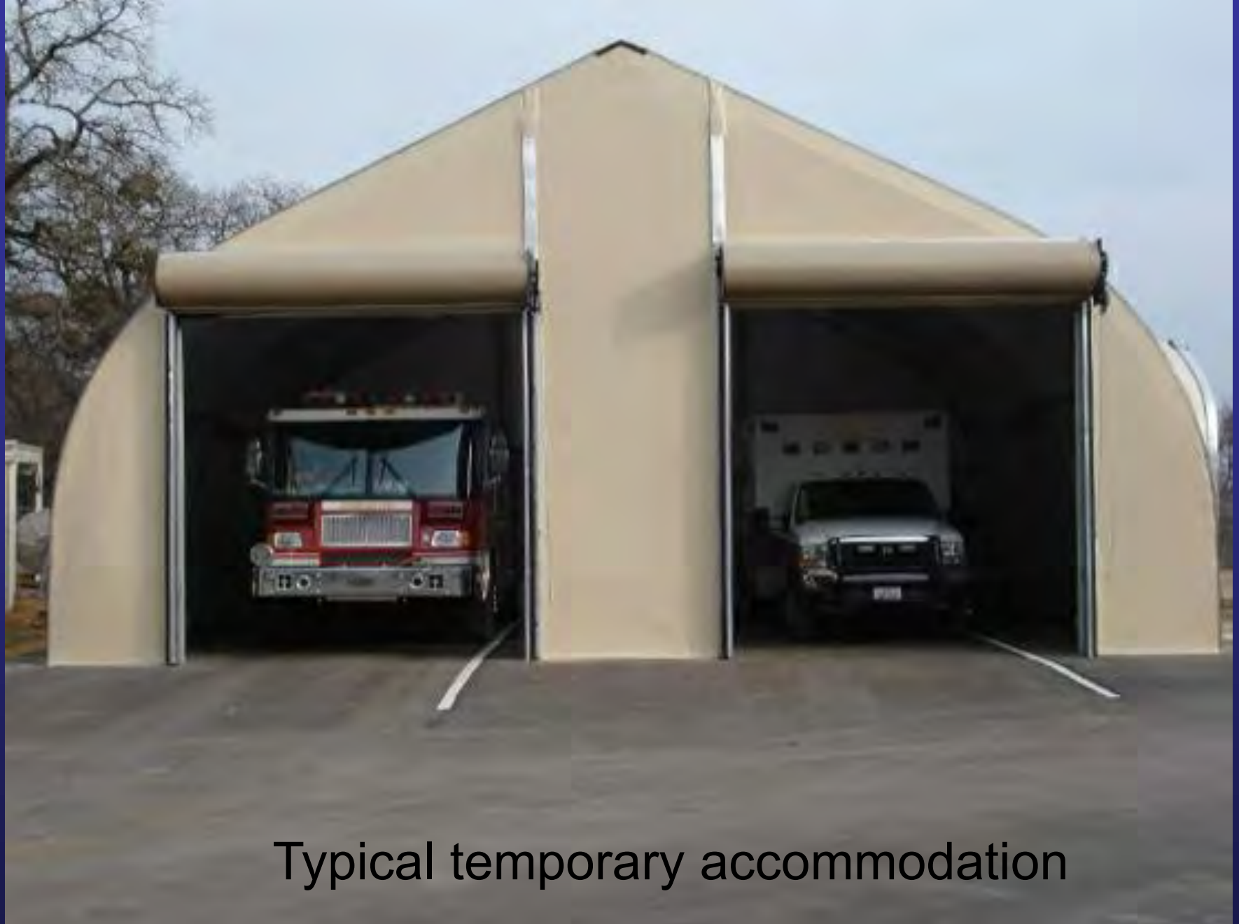
Typical temporary accommodation